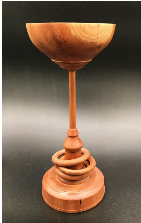
Jim’s captured ring goblet

A quick reminder to the members to keep track of meetings and demos. Meetings are every other week; demo emails are sent out.